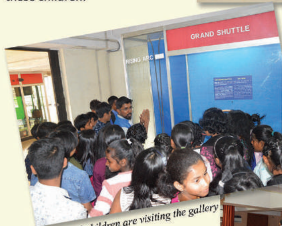
Underprivileged children are visiting the gallery

Around 3000 children along with their teachers visited the Centre under this scheme during the period April-June, 2019.