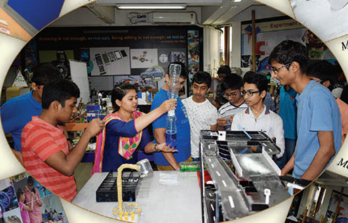
Participants of OCSC watching a demonstration on a science project during their visit to Innovation Hub