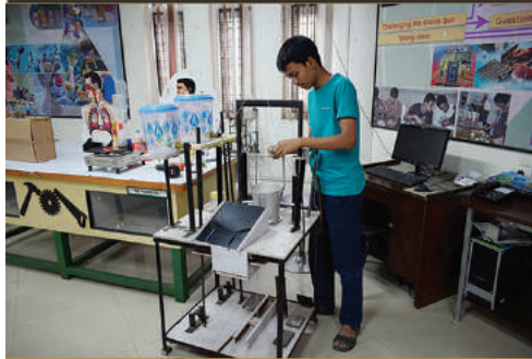
A Member busy in making his project

The Innovation Hub running at the Centre provides all basic facilities to its members in making their innovative ideas in to a tangible form. The education staff and the two Mentors looking after the Hub always trying to guide the students and extend all possible supports to solve any type of problem during their projects.