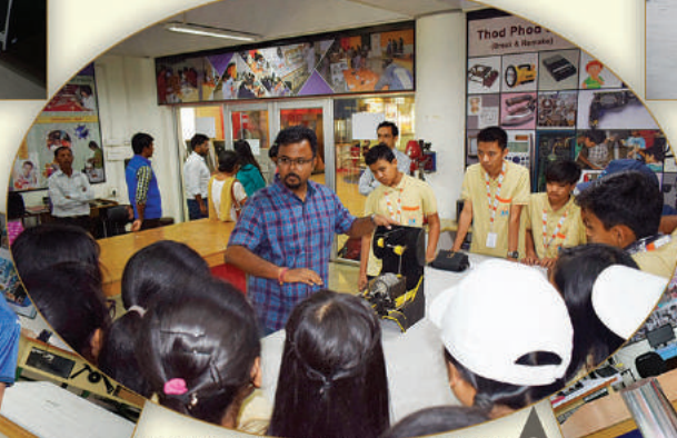
Mentors demonstrating projects before the student groups in Innovation Hub