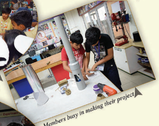
Members busy in making their project