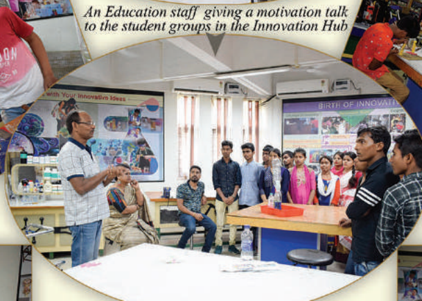
An Education staff giving a motivation talk to the student groups in the Innovation Hub