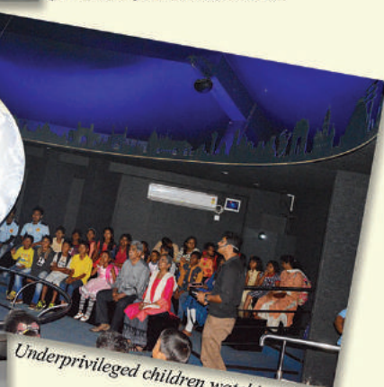
Underprivileged children watching the Science show