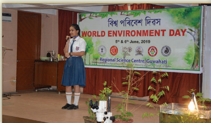
▲ A student delivering a speech on environment before the audience

Regional Science Centre, Guwahati celebrated the World Environment Day on 5 th and 6 th June, 2019 in its premises with varieties of participatory activities involving students, teachers and general visitors. The theme for 2019 is "Beat Air Pollution". The celebration programme started with Art competition for children in three different groups.