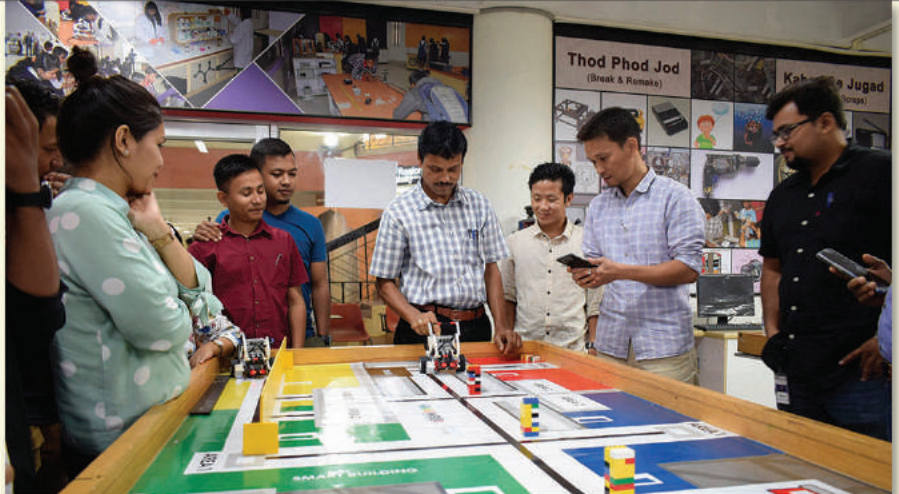
Top- Participants testing their robot

A workshop on Robotic Activity was organised at Innovation Hub in RSC, Guwahati from 24th to 28th June 2019. Mentors and other technical and educational staff from all Innovation Hubs, running at Science Centres in all over north eastern states took part in the workshop. Participants from state Assam, Arunachal, Manipur, Meghalaya, Mizoram, Nagaland and Tripura were present in the workshop. Innovation Hub is a section of Science Centre which provides a platform for the young students to engage in innovative and creative activities.