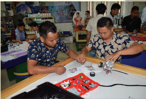
Right- Participants testing their line following robot