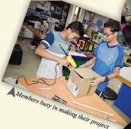
Members busy in making their project