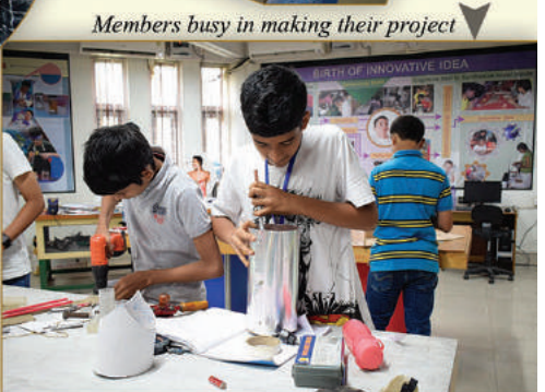
Members busy in making their project