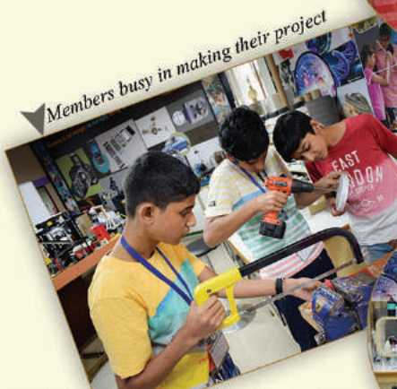
Members busy in making their project