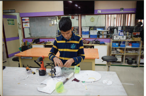
A Member busy in making his project