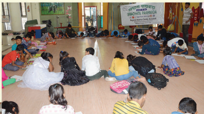
Children participating in Art competition