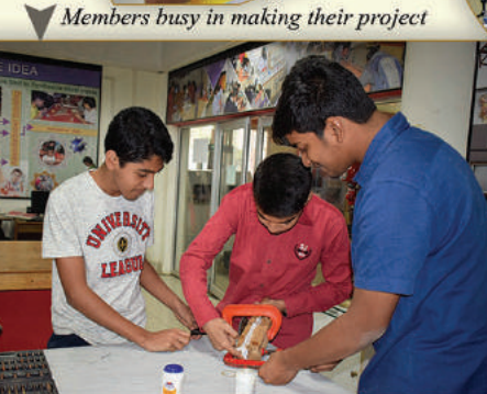
Members busy in making their project

During the quarter, the student members of Innovation Hub completed the following projects by using scraps and low cost materials.