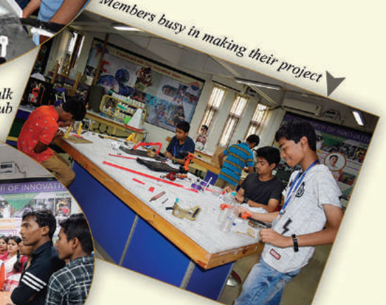
Members busy in making their project